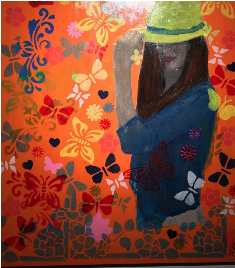
Mariposa Soñadora* Butterfly Dreamer

*artwork and quote shared with child's consent